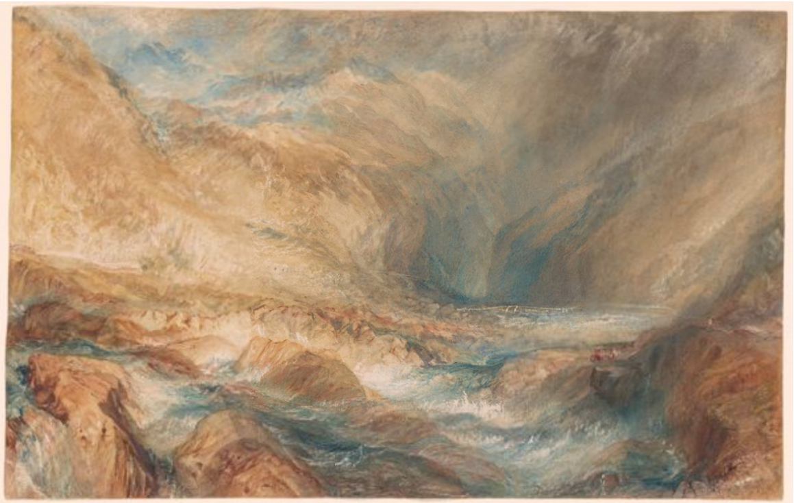
Joseph Mallord William Turner, The Pass at Faido, St Gotthard , 19th century, Watercolor.

FIFTH SUNDAY OF EASTER Service for the Lord's Day May 15th, 2022