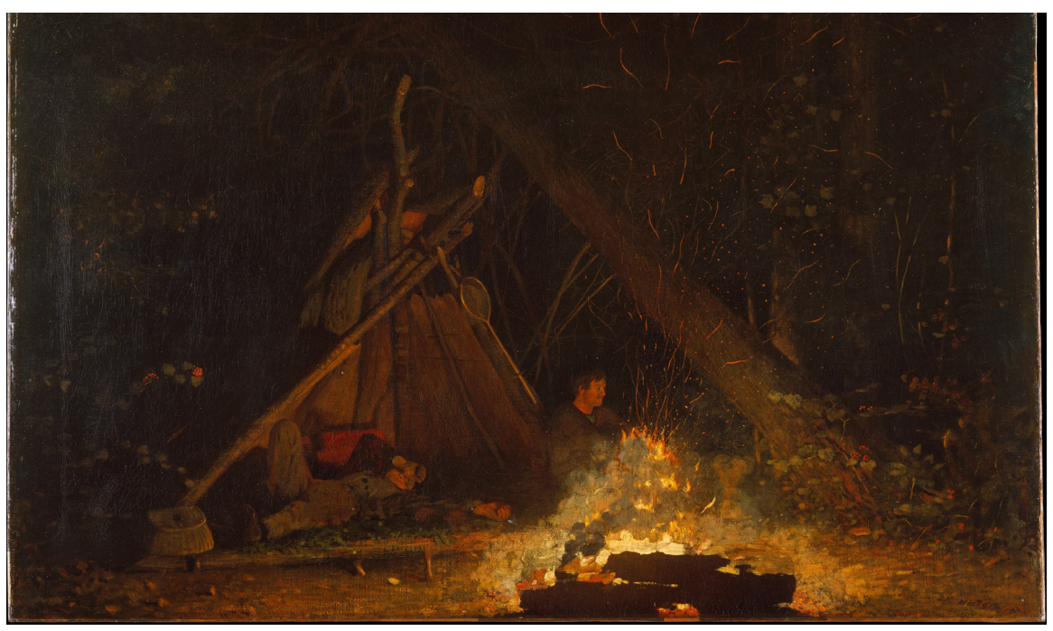
Winslow Homer, Camp Fire, 1880, oil on canvas.

Service for the Lord's Day May 29th, 2022