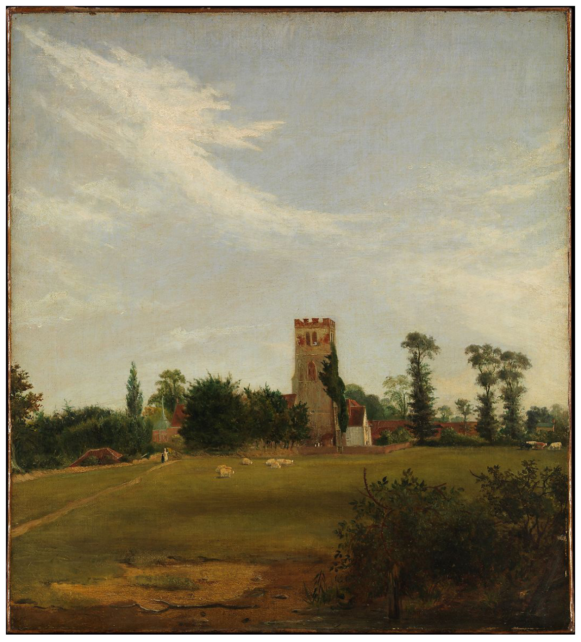
British Painter (ca. 1830), Tottenham Church

Service for the Lord's Day May 8th, 2022