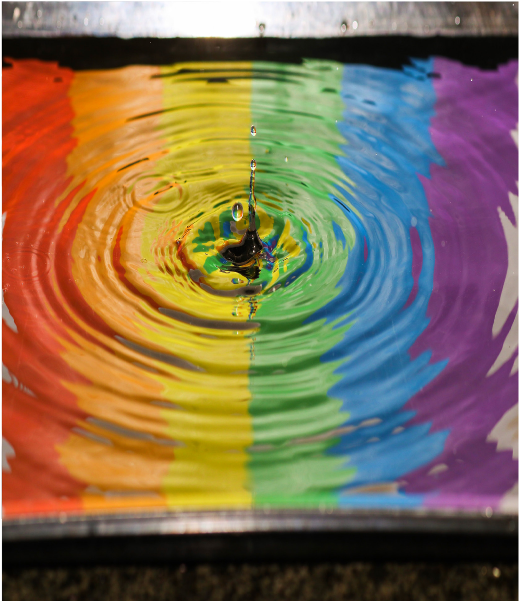
Jordan McDonald, Time Lapse Photography of Water Ripple , 2018.