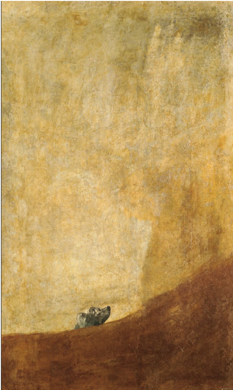
Francisco de Goya, The Drowning Dog , 1820-23, mixed method on mural transferred to canvas.