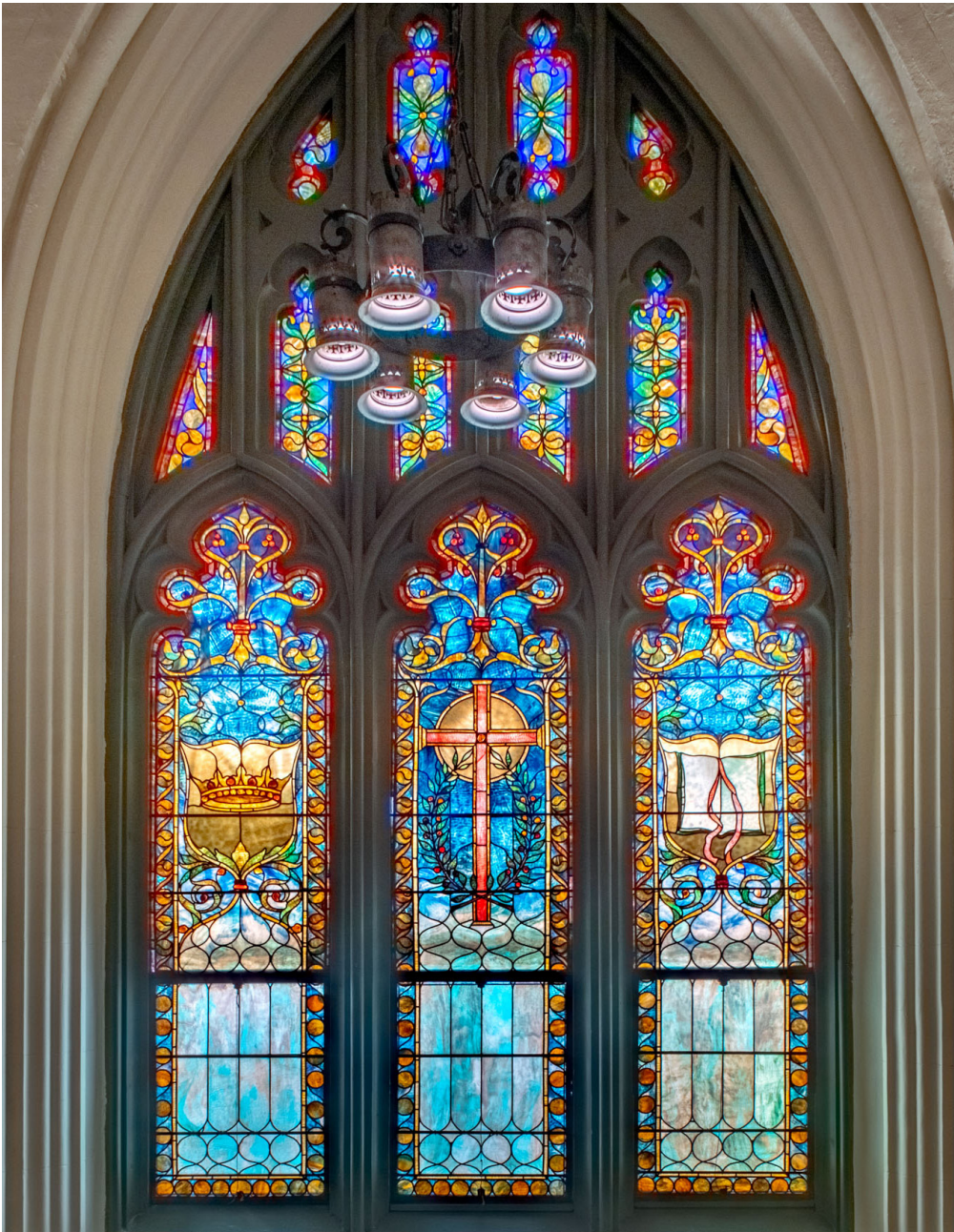
Wei Chao, 2020, photograph.