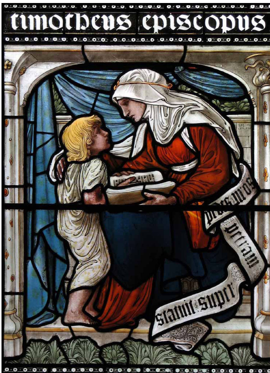
Edward Burne-Jones, "St. Timothy and His Grandmother Lois" (c. 1872), Vyner Memorial Window in Oxford Cathedral.