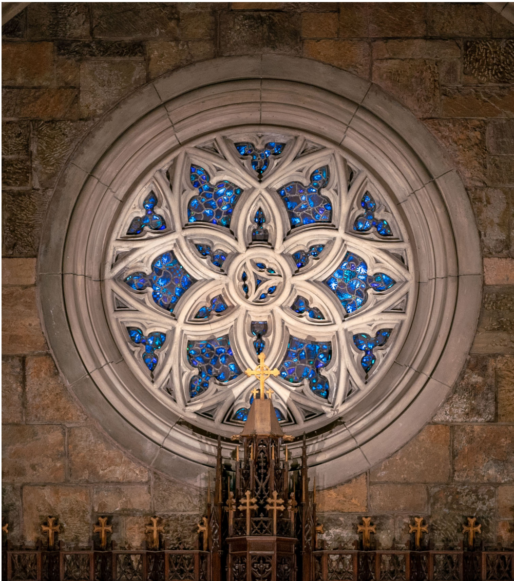
The Rose Window, Wei Chao, 2020, photograph.