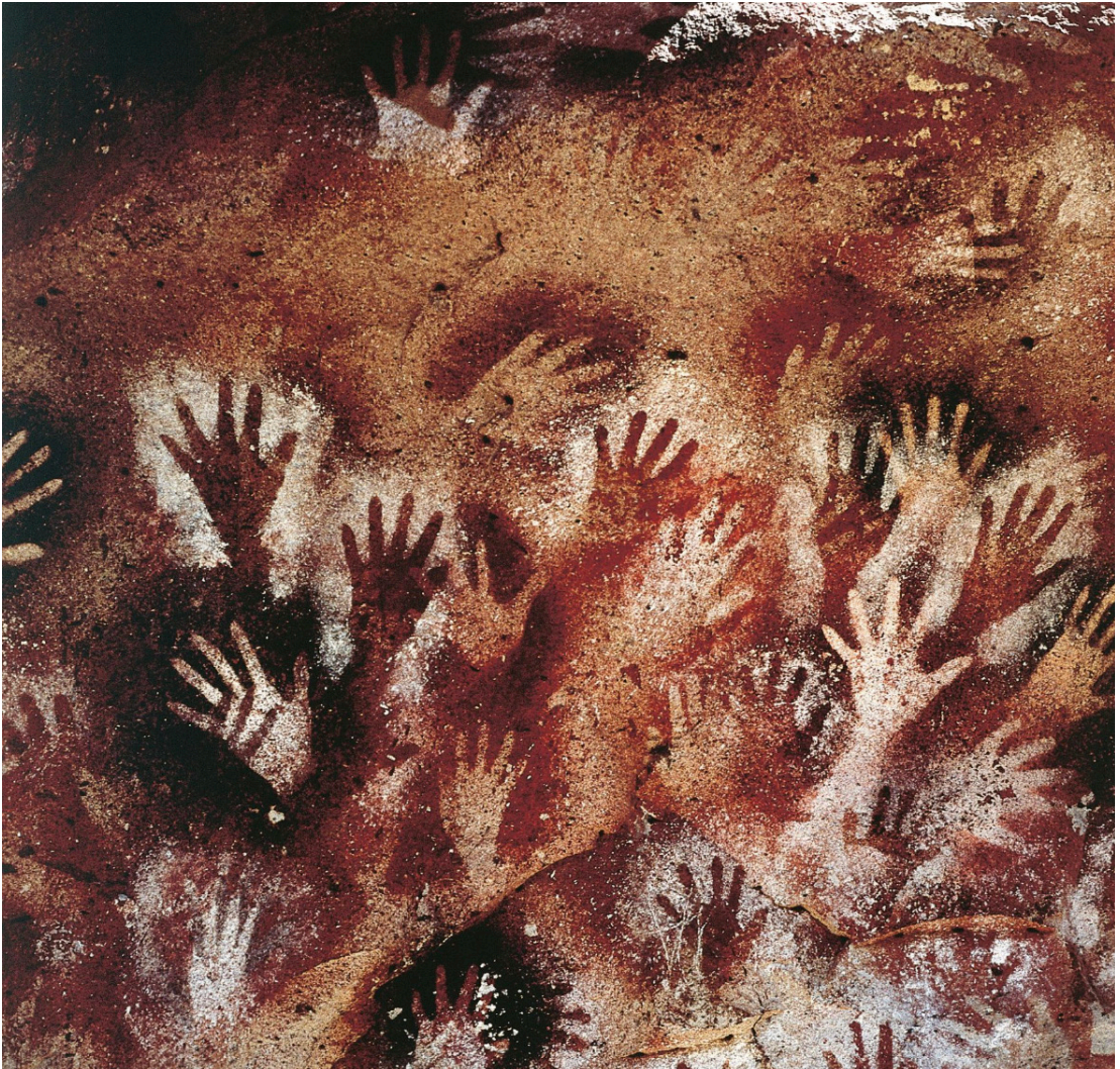
Cueva de las Manos (Cave of Hands), 7,000 BC, Santa Cruz, Argentina