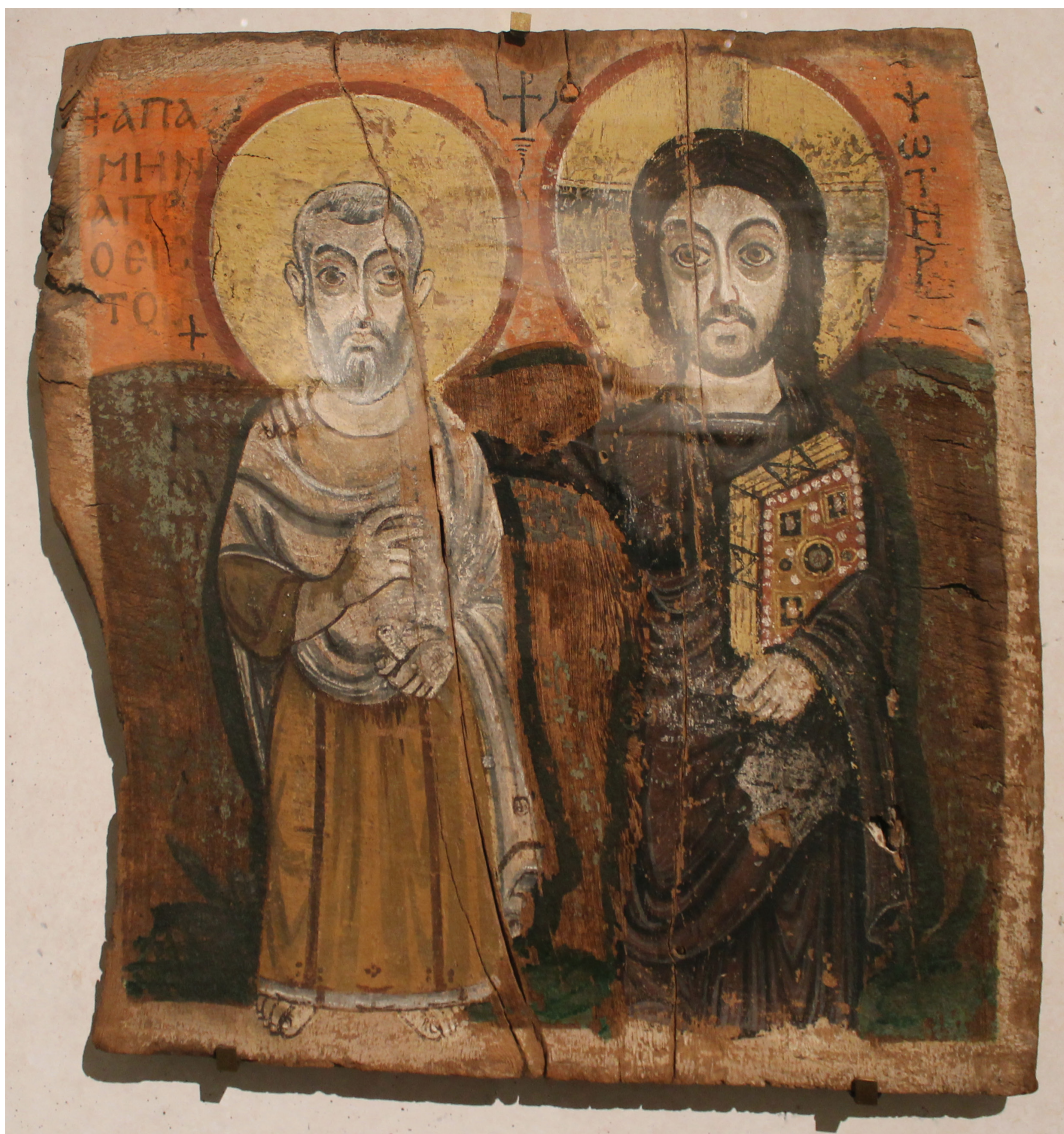
Icon of Christ and Abbot Mena (The Friendship Icon), c. 750, encaustic and wood.

FOURTH SUNDAY IN LENT Service for the Lord's Day March 19th, 2023 | 11 a.m.