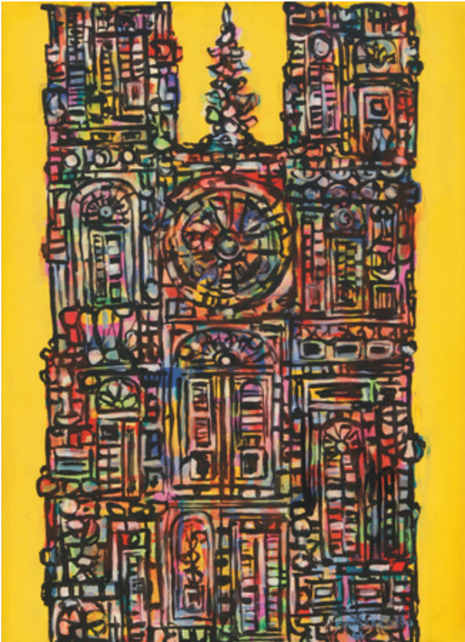
Cathedral in Yellow , Rene Portocarrero, Cuba, 1961.

FOURTH SUNDAY OF EASTER April 30th, 2023 | 11:00 a.m.