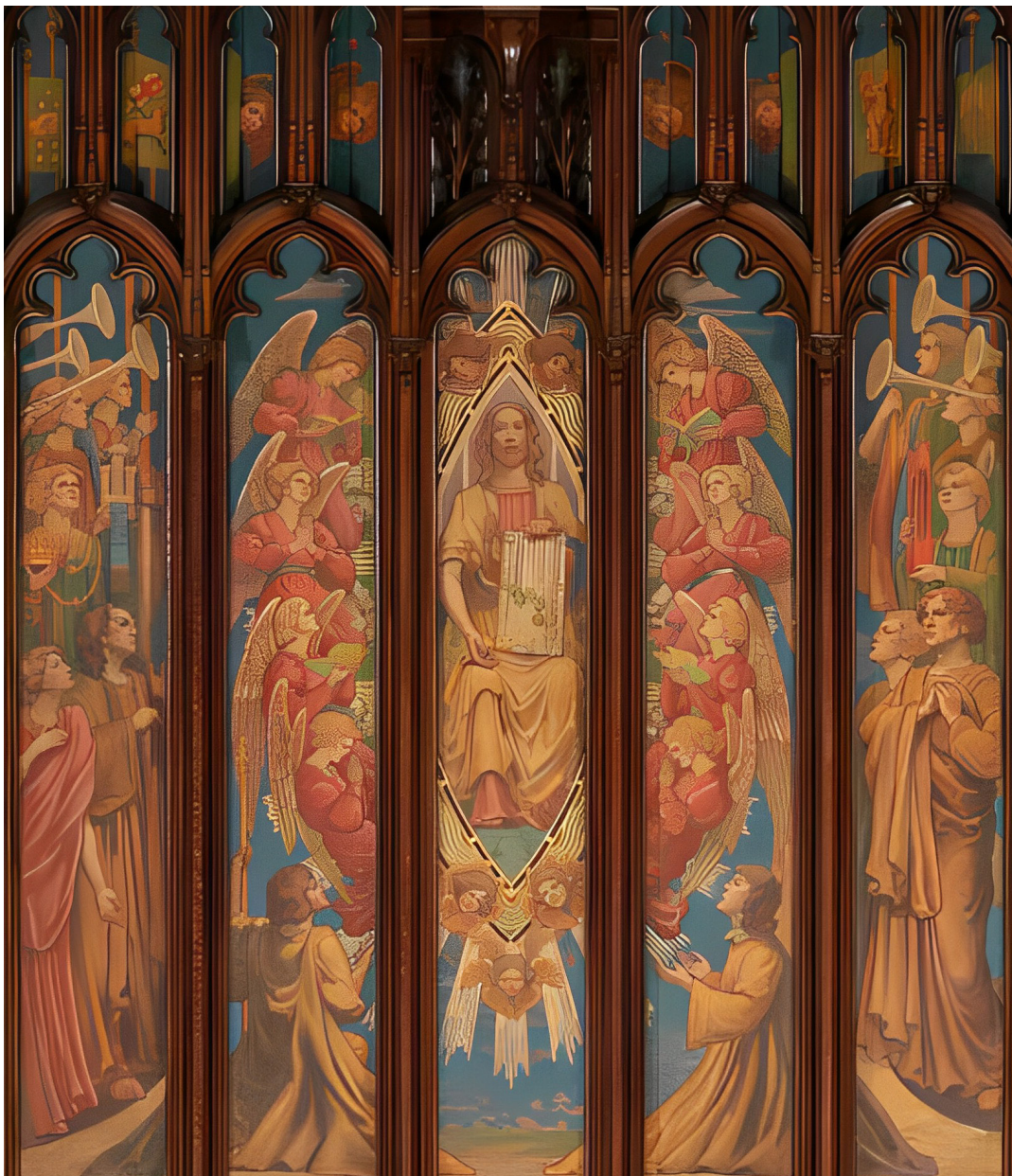
Wei Chao, 2020, photograph.