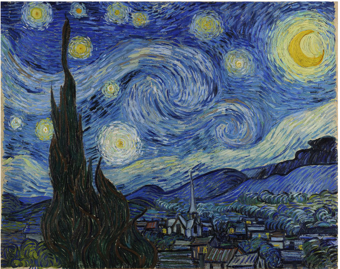
The Starry Night , Vincent van Gogh, Saint Rémy, June 1889.