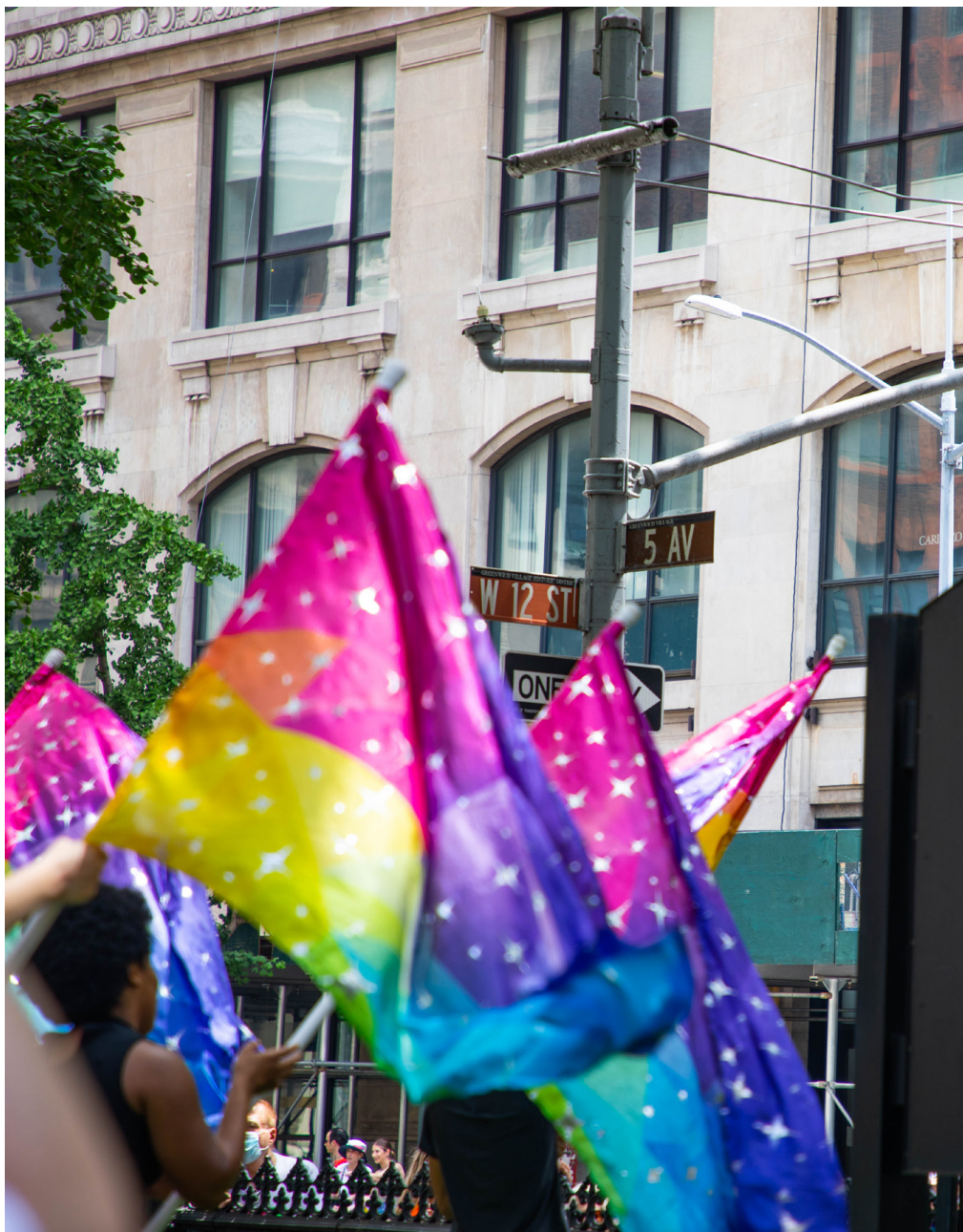
Pride Sunday at 12th St, Sophia Yacca, 2021.