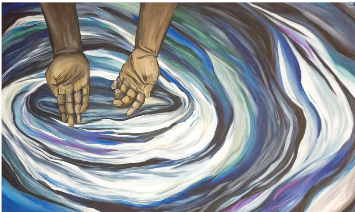
They Said No Inspired by Exodus 1:8-22, Lisle Gwynn Garrity, acrylic on canvas. © A Sanctified Art