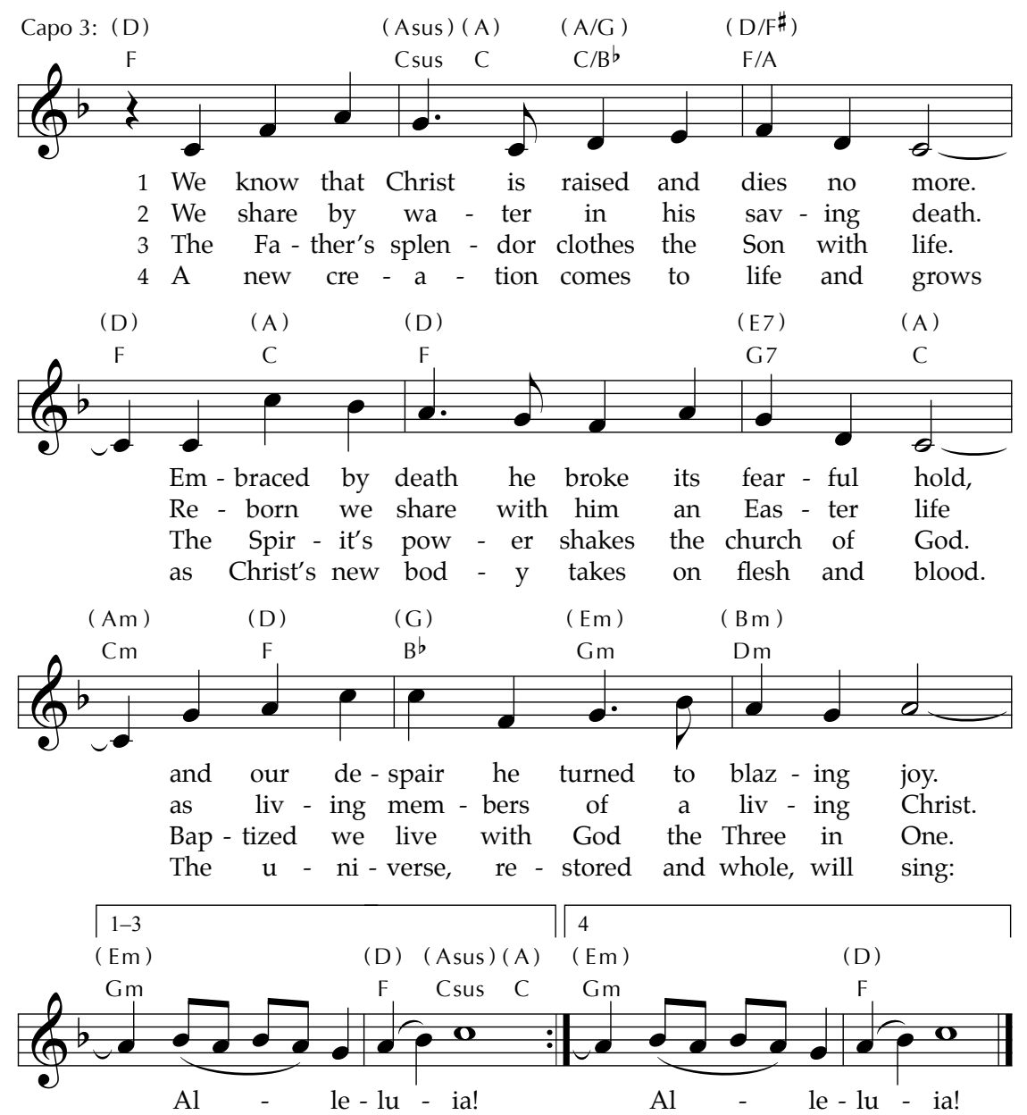
Guitar chords do not correspond with keyboard harmony.

Beginning with an allusion to Romans 6:9, this exuberant baptismal hymn unfolds the implications of our incorporation into Christ's new life, making us "a new creation" (2 Corinthians 5:17). The text was written to fit this expansive tune by a distinguished British composer.