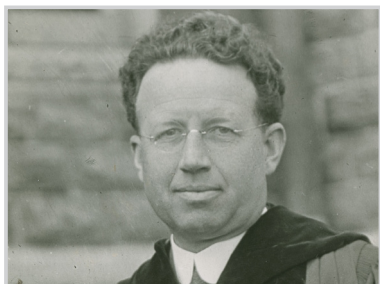
Harry Emerson Fosdick, 1925