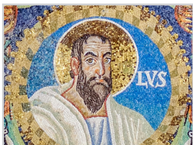
Paul the Apostle, detail of the mosaic in the Basilica of San Vitale, Ravenna, 6th century