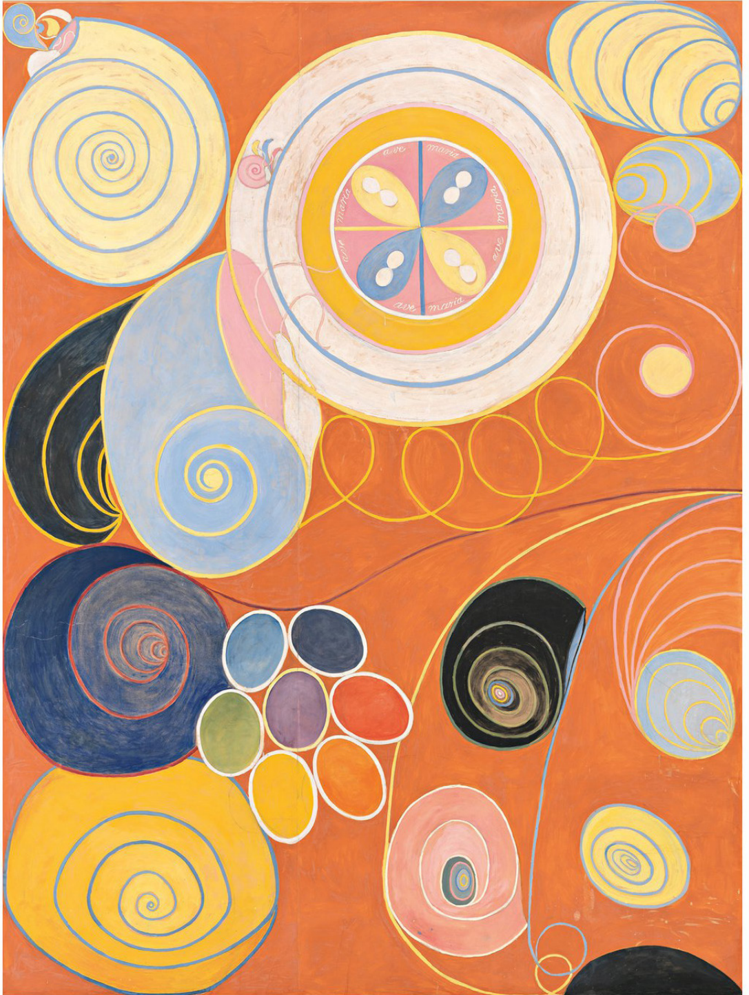
Hilma af Klint, Group IV, The ten largest, no 3, youth, 1907

Service for the Lord's Day | May 17, 2026 | 11:00 a.m.