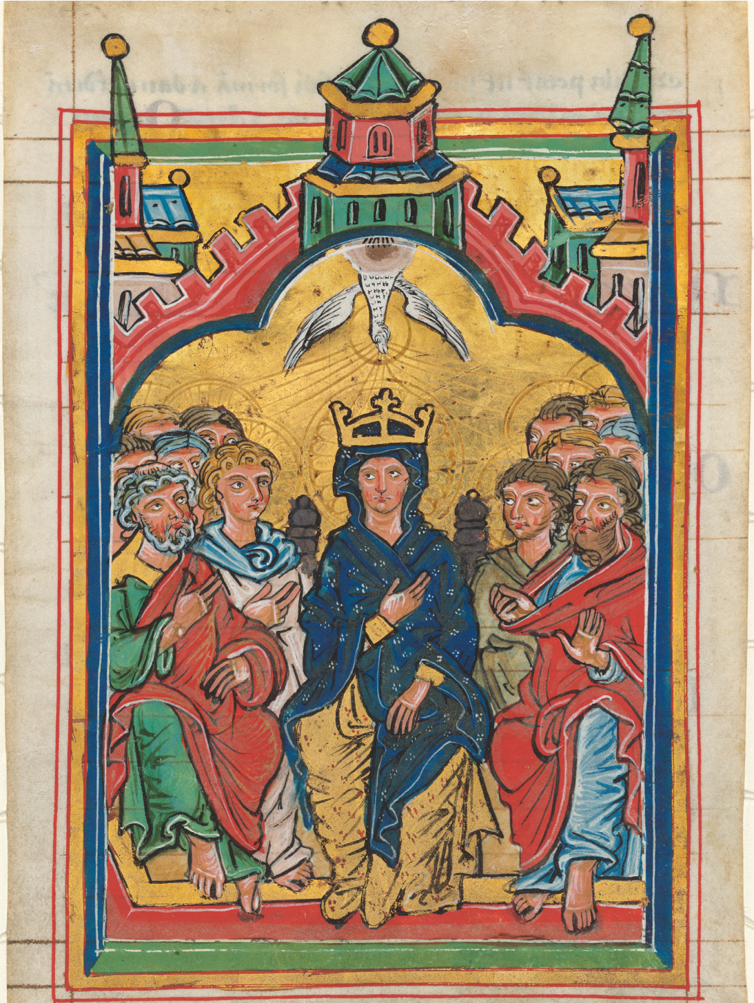
Pentecost, mid 13th century German

Service for the Lord's Day | May 24, 2026 | 11:00 a.m.